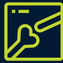
Bone density tests