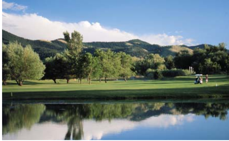
Green Meadow Country Club